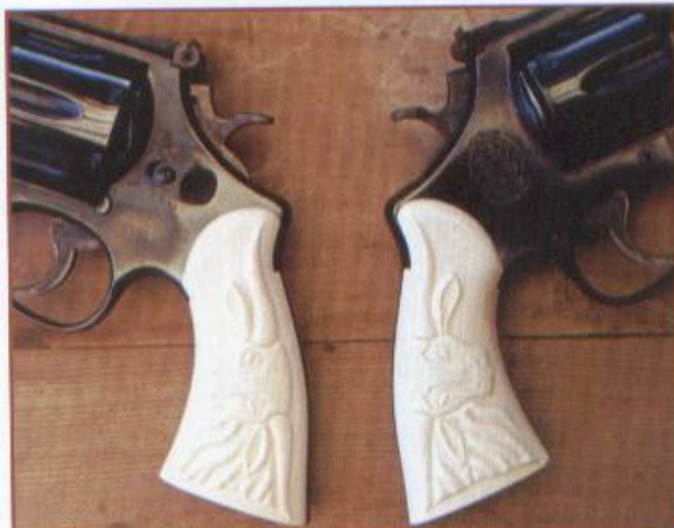
Carved ivories by Bob Leskovec on a pair of 4" S&W .44 Specials. He can also duplicate the same pattern on single-action stocks.