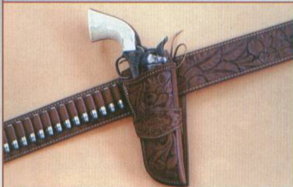
85-year-old 1 st Generation .45 Colt fitted with ivories carved in the fleur-de-lis pattern by Peacemaker Specialists, in El Paso #1930 Austin leather.