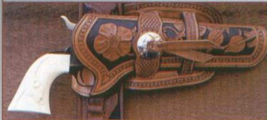
7-1/2" SAA .45 by Colt, leather by San Pedro, carved ivories by Paul Persinger.