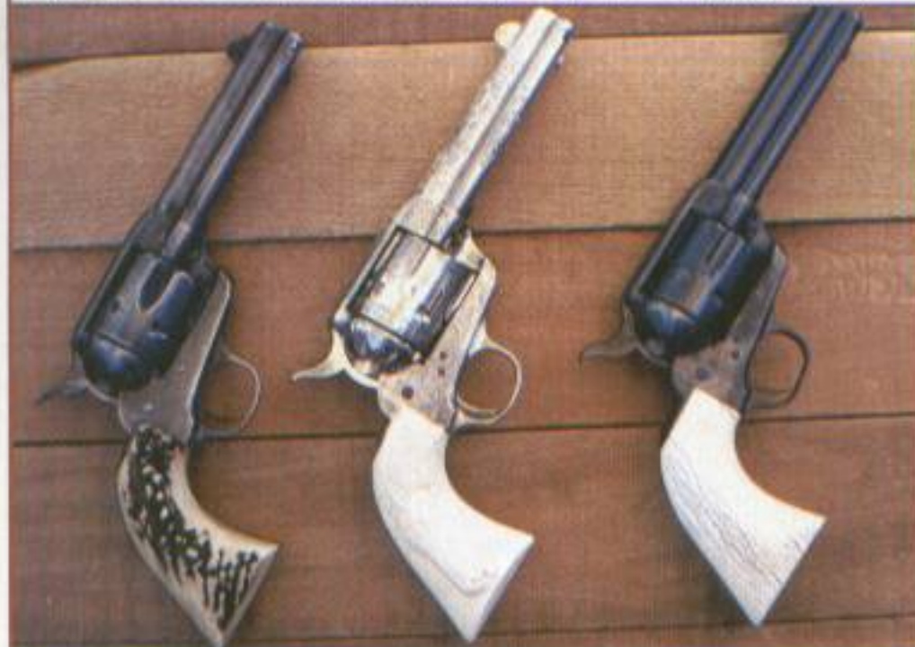
Stocks on Colt Single Actions rebuilt by Peacemaker Specialists with stag, carved ivory, and one-piece ivory.

stocks found on 3rd Generation Colts. Once I had that first pair of floral-carved El Paso Saddlery holsters, the factory grips on my 7-1/2" Colts looked oh so plain. Something drastic had to be done.