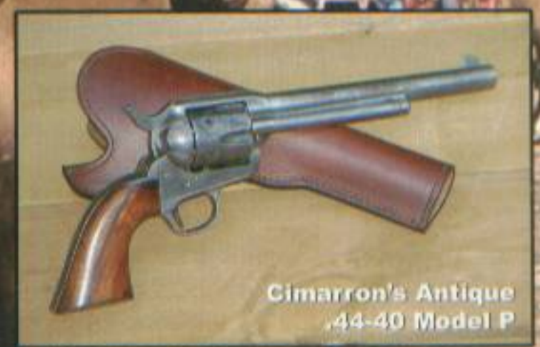
Cimarron's Antique .44-40 Model P