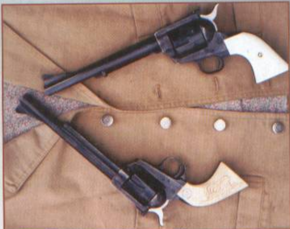
The New Frontier on the left wears carved stocks by Bob Leskovec of Precision Pro. These are in acrylic, but he can do the same grip in ivory.

grips towards an old pair of one-piece ivories checkered in the fleur-de-lis pattern. I now have a .45 Colt that is tight and perfectly functioning, while still maintaining its antique-finish look. Peacemaker Specialists is one of the best places to look for parts and custom stocks for Colt Single Actions, especially old ones such as this .45.