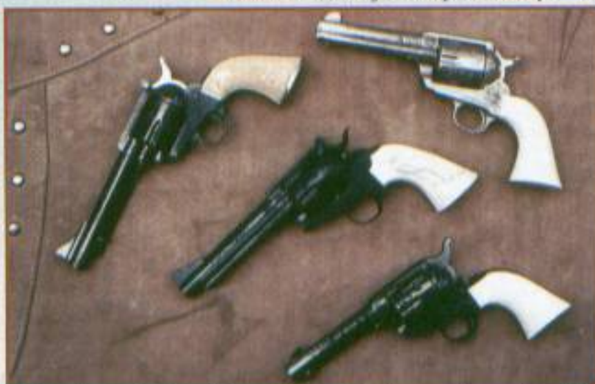
These four sixguns all have ivory. The bottom sixgun is a Colt Single Action with one-piece stocks, and the other three are from Texas Longhorn Arms. They include a West Texas Flat-Top Target, a South Texas Army, and an Improved Number Five, all built by master gunmaker Bill Grover.

PAUL PERSINGER: The Colt Single Action Army is one of the few factory sixguns that come with stocks that fit my hand. The only reason to replace them is to come up with a more exotic material than black rubber eagle grips or the extremely plain walnut