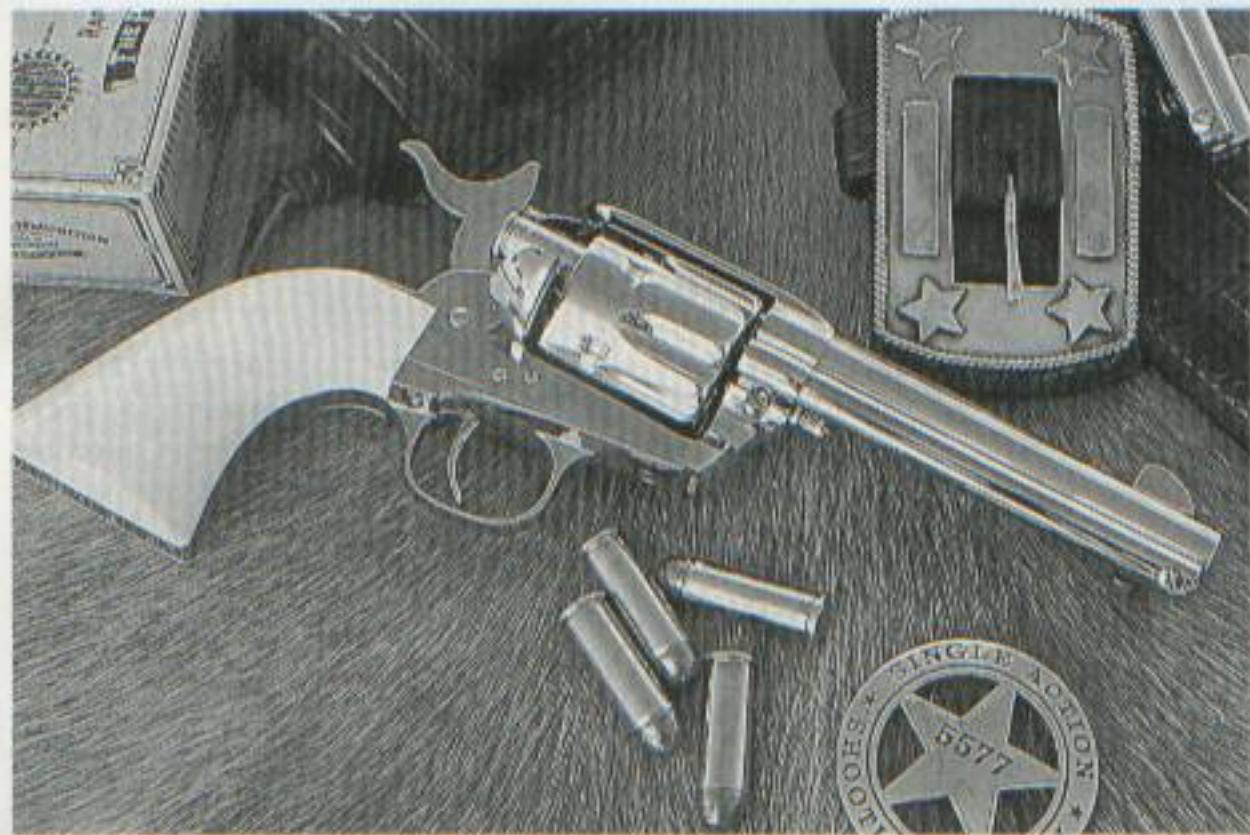
With custom cylinder flutes and period radiusing, Peacemaker Specialists' matching Colts are tastefully dehorned on their exterior.

modifies the bolt to tighten the cylinder fit and eliminate skipping, after which he refits the hand to adjust out over-travel.